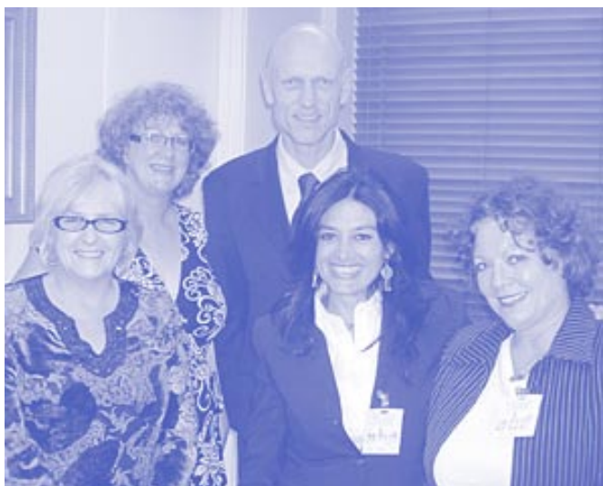
AusCAN members with Minister Peter Garrett in Canberra

CAN WA kept connected and abreast of national issues and trends through email and phone contact with other community arts based agencies and individuals across Australia.