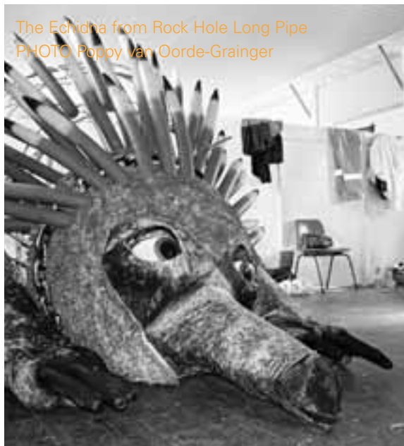
The Echidna from Rock Hole Long Pipe