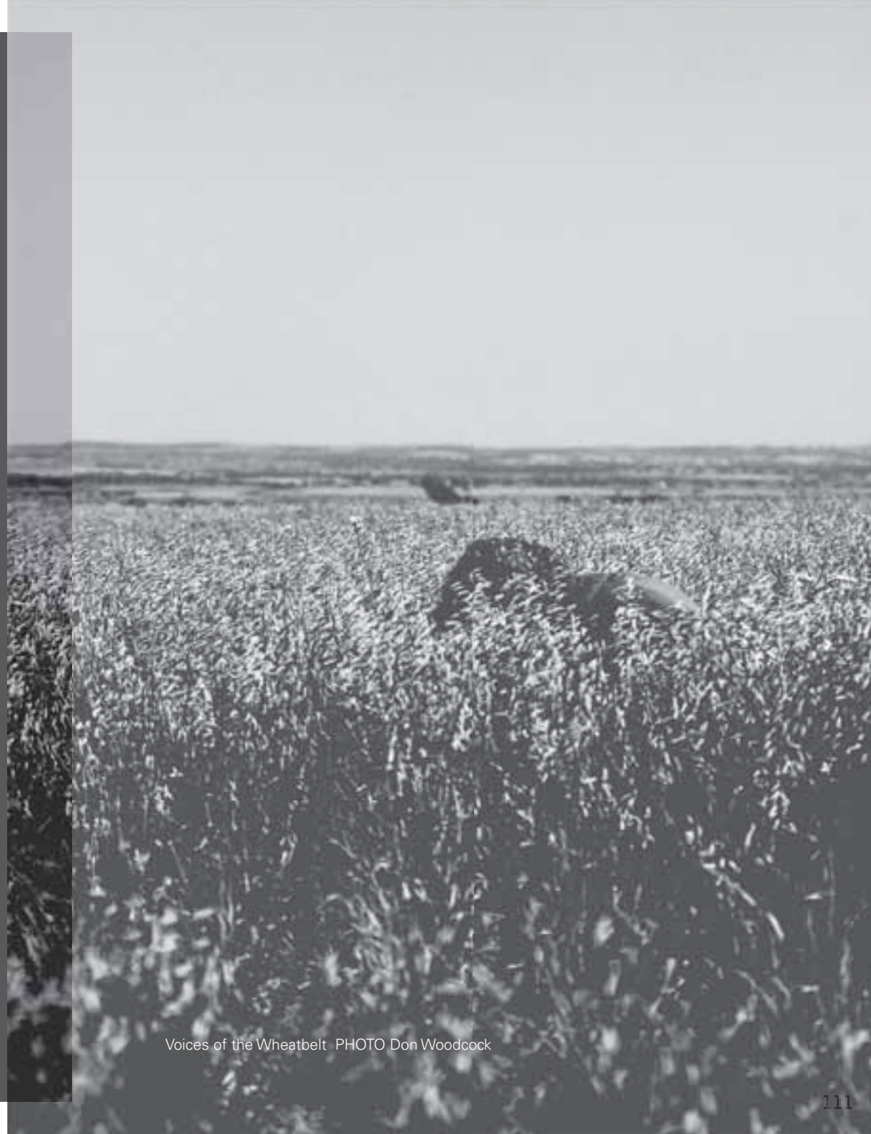
Voices of the Wheatbelt