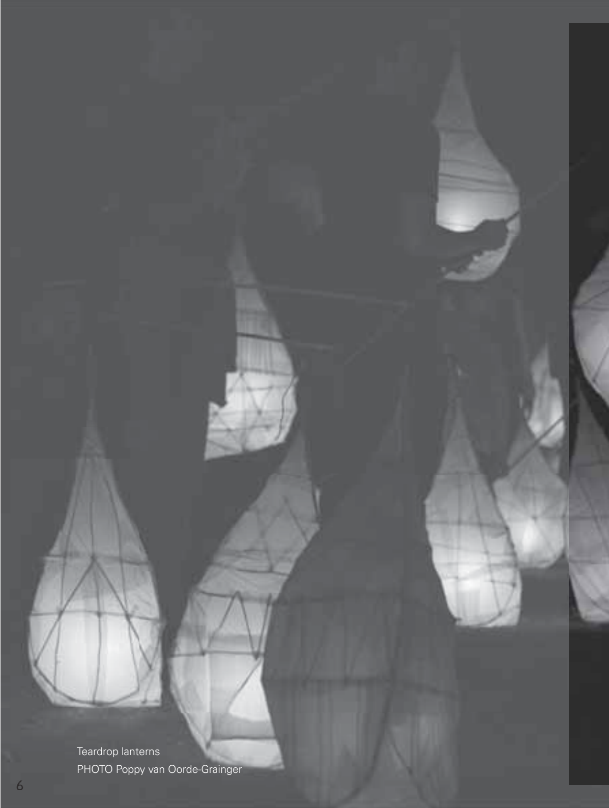
Teardrop lanterns