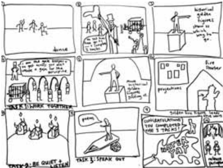
Top: Coolgardie Water Dreaming banner