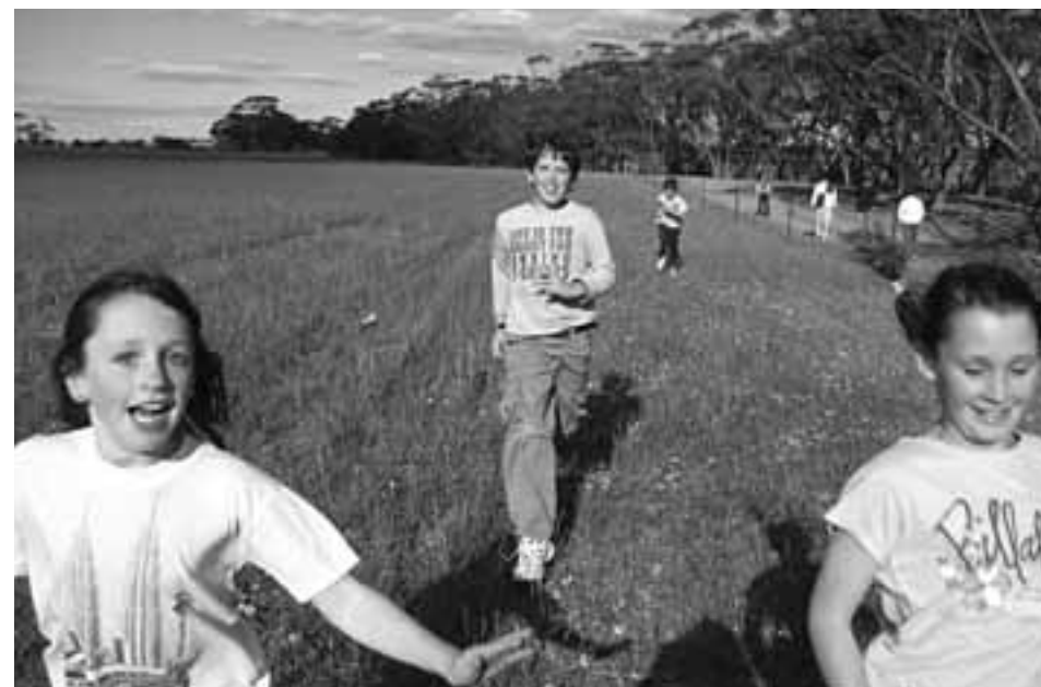
TOP Voices of the Wheatbelt