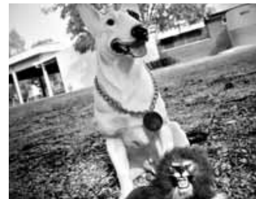
Voices of the Wheatbelt