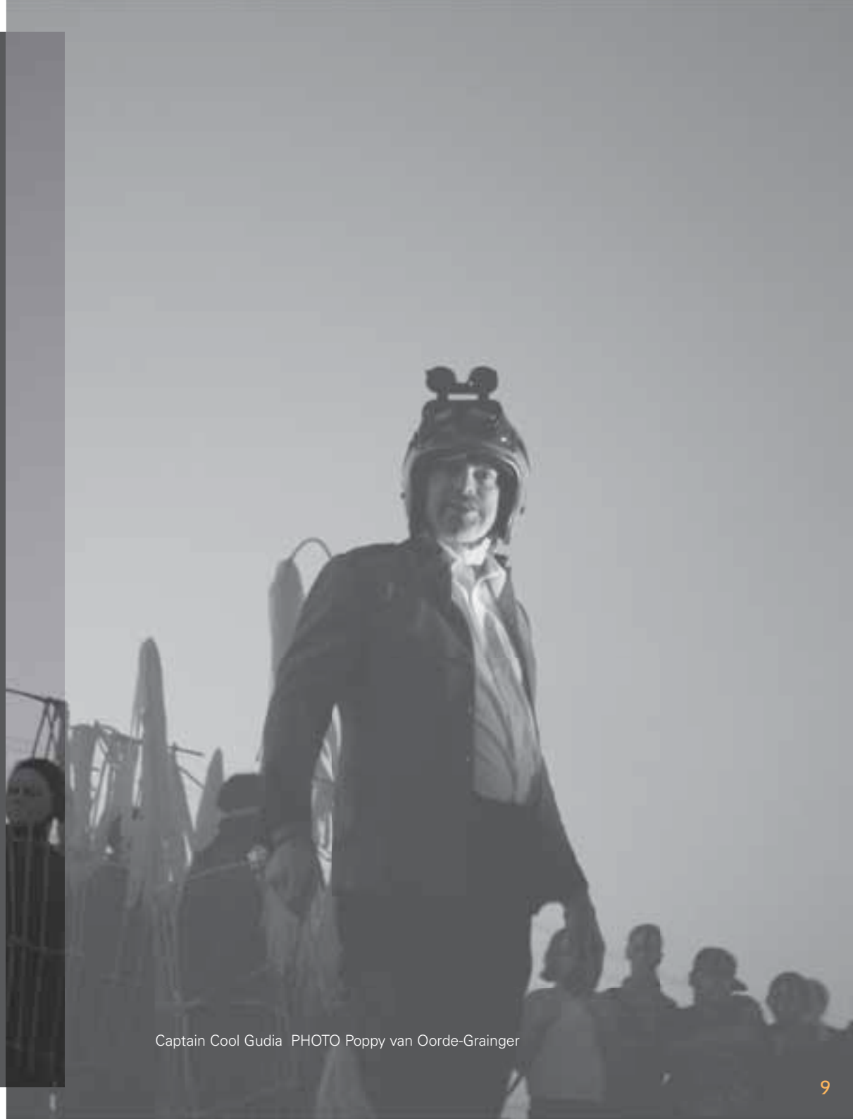
Captain Cool Gudia

The publication of these evaluation reports is part of the ongoing commitment of CAN WA to share the learning that arises from our work. We do this to assist others working in this field and to encourage others to see community arts and community cultural development as an effective, powerful and creative approach to working with communities.