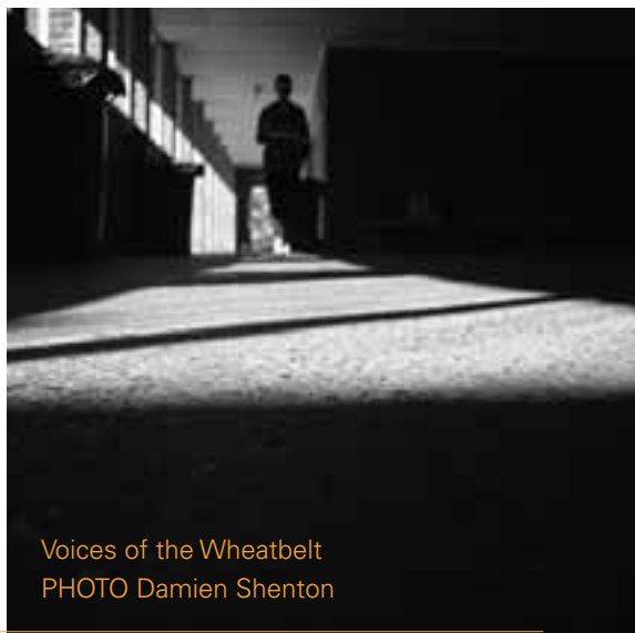
Voices of the Wheatbelt

Overall the photo-elicitation was central to the broader process of creating opportunities for participation and a context within which people could share personal stories and thereby create collective stories about the communities in which they live. It was experienced as empowering because people learnt about their own capacity to create art and they also began to imagine together the possibilities for continuing these activities into the future.